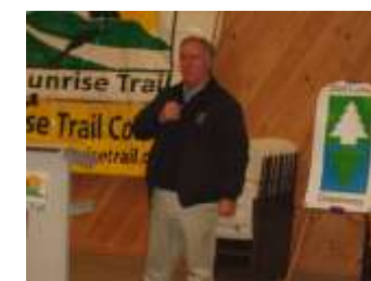
Department of Transp. Commissioner Cole