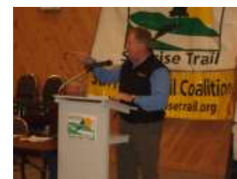
Dept. of Conservation Commissioner McGowan