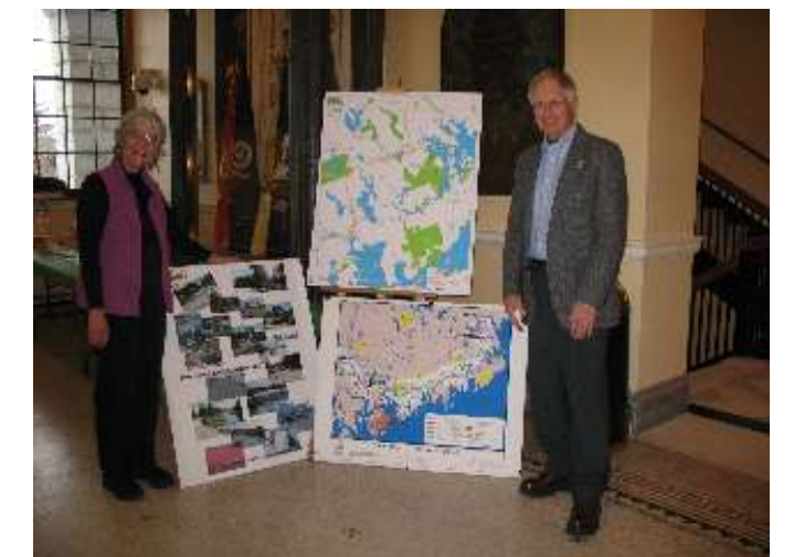
The Down East Sunrise Trail was represented at the Washington County Tourism Event at the Hall of Flags in the Capitol Building in Augusta on February 17 th . It was a great success!