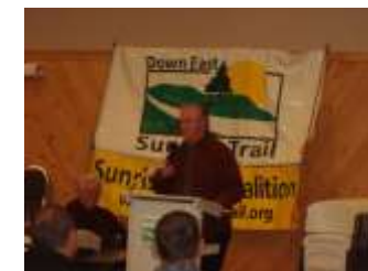
State Representative Burns Speaks at the 2009 Annual Meeting