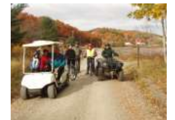
Multi-use includes Golf Carts!