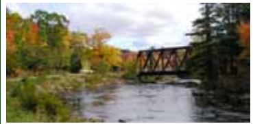
Steel trestle bridge at Cable Pool

Cable Pool, now a town park, is a historically significant salmon pool. It makes a great picnic spot.